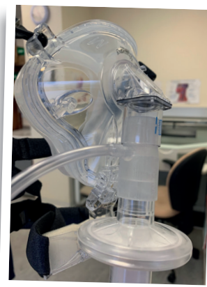
Oxygen breathing inlet