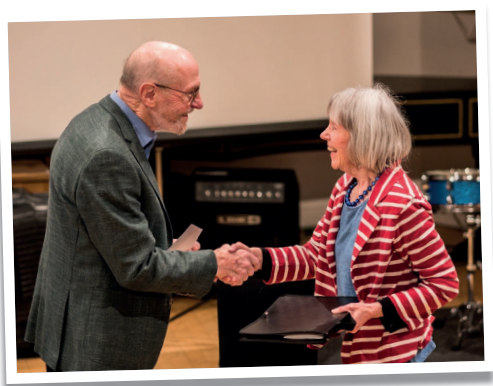
£3,000 from the Shrewsbury Community Choir.