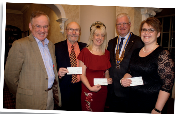
£2,701.45 from The Rotary Club of Shrewsbury Severn money raised from the Tree of Lights.